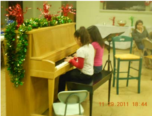
These two beginning piano students played a duet perfectly at the Arts Academy First Recital and Art Show.

Please continue to hold the Whiz Kids & Arts Academy in your prayers.