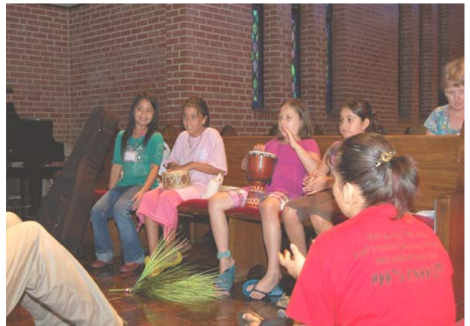
The Colobus monkeys use instruments creatively in their music time