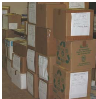
Did Somebody Say Boxes?

Do I dare ask God what He has in store for US-next? Thanks be to God for revealing to us just what He had in mind for us.